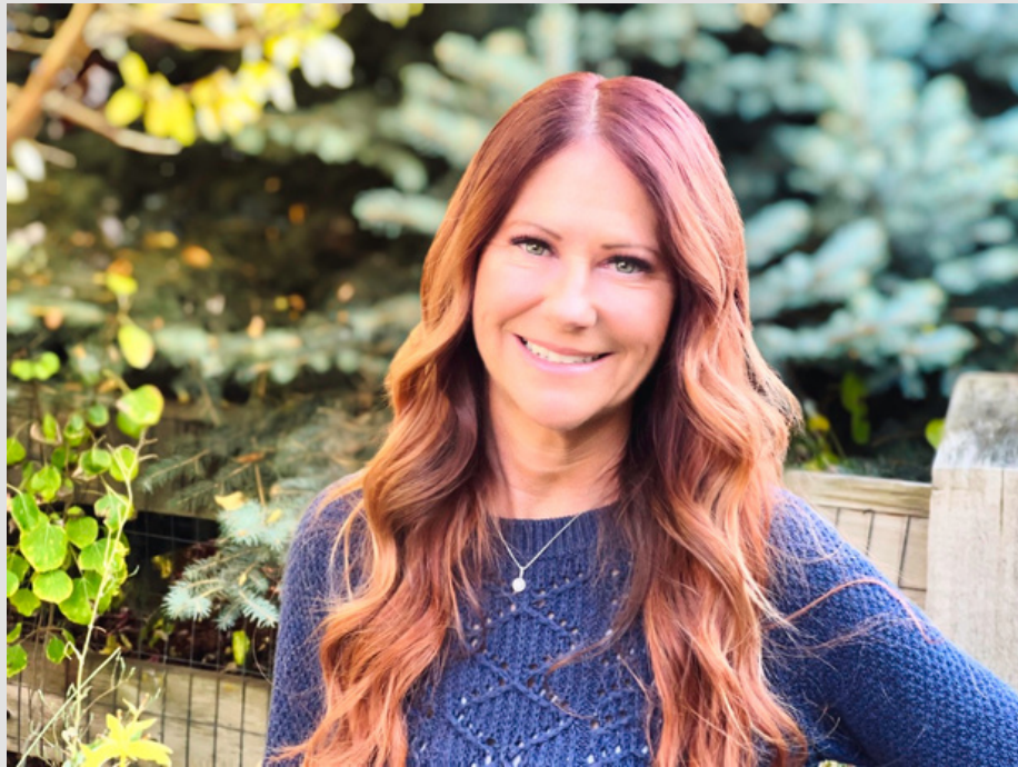
Mission Director, “I Love U Guys” Foundation